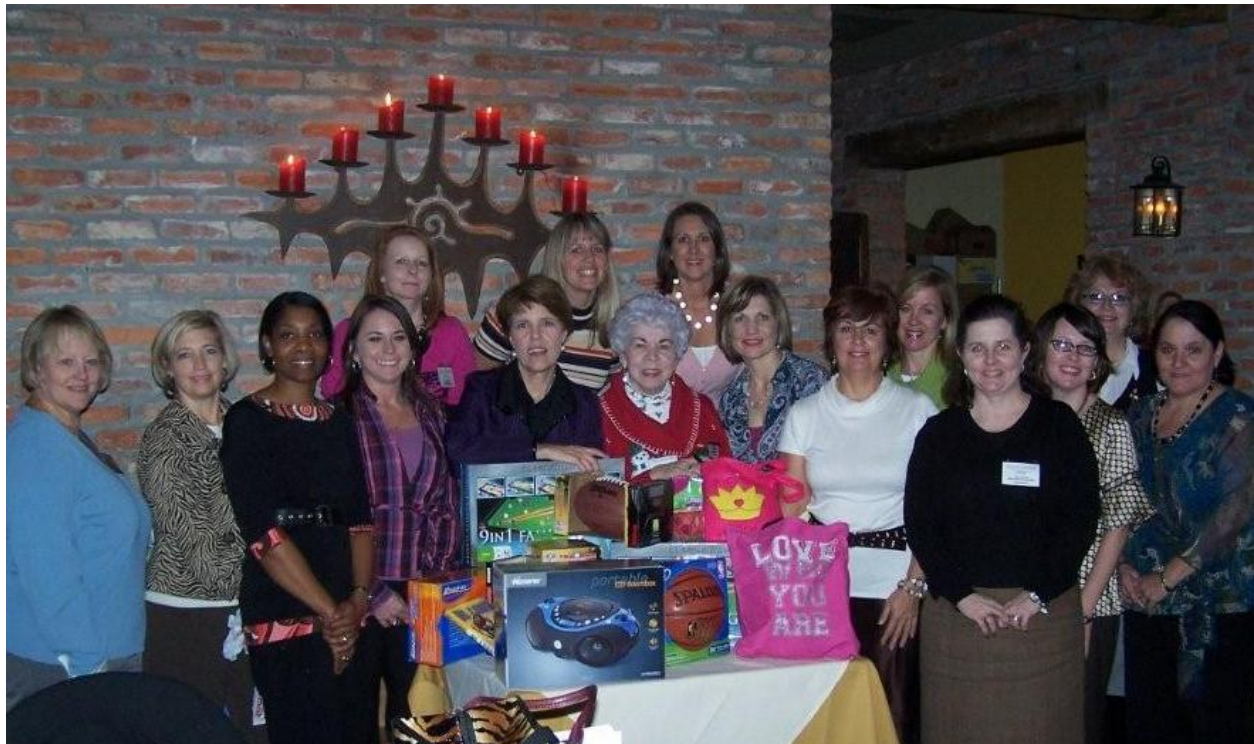
EWI Baton Rouge Chapter pictured with gifts donated to the YMCA's Angel Tree